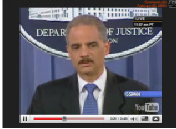
ATTORNEY GENERAL ERIC HOLDER at his Feb. 25 press conference said that the Justice Department would implement the President's policy as expressed on the campaign trail. He did not say "No more DEA raids," as claimed on reform groups' websites.